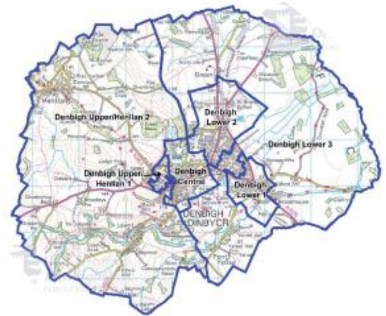
Map showing the Lower Super Output Areas in Denbigh

Part of the index which relates to how easy it is for people to access services such as schools, clinics, shops and leisure centres and the Llanrhaeadr yng Nghinmeirch, Llansannan, Trefnant and Tremeirchion, Cwm & Waen wards are considered to be amongst the 10% most deprived in Wales in this regard with the Llandyrnog ward being in the 20% most deprived.